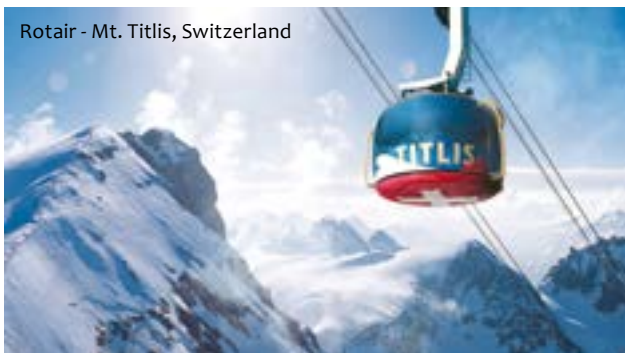
Rotair - Mt. Titlis, Switzerland

Today, proceed on an excursion to Mt Titlis. Ride two different cable cars and be amazed as the scenery changes from green meadows, scenic lakes to snow clad mountains. The last leg of the ascent will be in the world's first rotating cable car called the 'Titlis Rotair'. At the Terrace on top of the Mt. Titlis summit station, weather permitting, you could take a stroll on the - The Cliff Walk. Next, we proceed for an orientation tour of Lucerne. See the Lion Monument, 'Lowendenkmal' carved in a limestone cliff to commemorate the bravery and loyalty of Swiss Guards. In