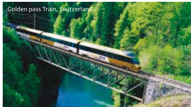
Golden pass Train, Switzerland

Matterhorn Express cable railway and further up by a lift built into the rock - to the highest sightseeing platform in Europe. You can also go snow tubing and visit Europe's highest ice palace. Later, we proceed to Tasch. Overnight in Tasch. (B, D)