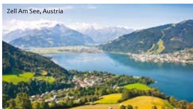
Zell Am See, Austria

Today, on your guided city tour, drive on the Ring Boulevard and see the State Opera House, the Parliament, the City Hall and the Burgtheater. Make a photostop at the Belvedere Palace former summer residence of Prince Eugene. Walk along the St