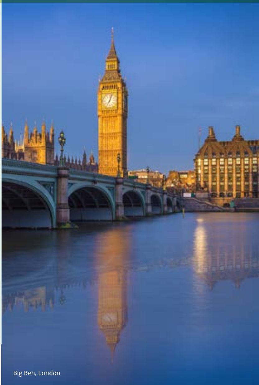
Big Ben, London

Piccadilly Circus and the symbolic Tower Bridge. Ride the London Eye by the river Thames. Hold your breath as you take a thrilling ride on one of the world's tallest Ferris wheel. Overnight in London. (B, D)