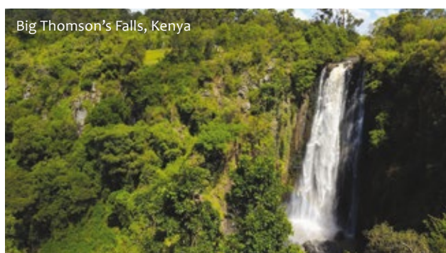
Big Thomson's Falls, Kenya