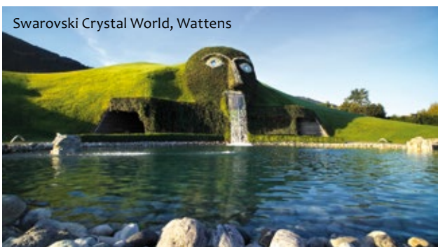
Swarovski Crystal World, Wattens

Today, visit the Swarovski Crystal World in Wattens. Next, visit Innsbruck and see the 'Goldenes Dachl' or Golden Roof and the Heiblinghaus, a building resembling a wedding cake. Later, we drive to Venice. Overnight in Venice/Padova. (B, D)