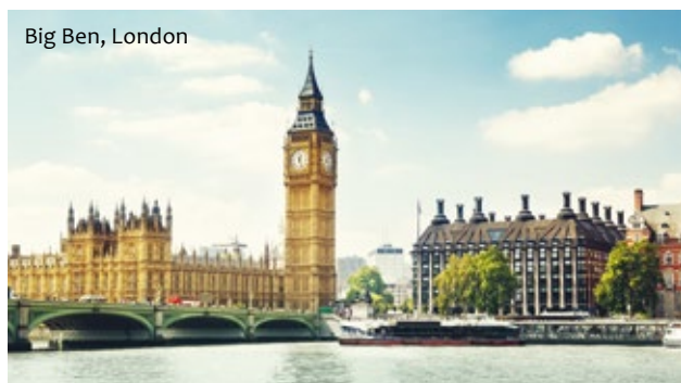
Big Ben, London

Welcome to London. On arrival check into your hotel on your own anytime after 1500 hrs. Overnight in London. (D)