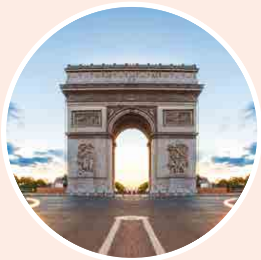
Arc de Triomphe, Paris