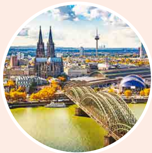
Cologne Cathedral, Germany