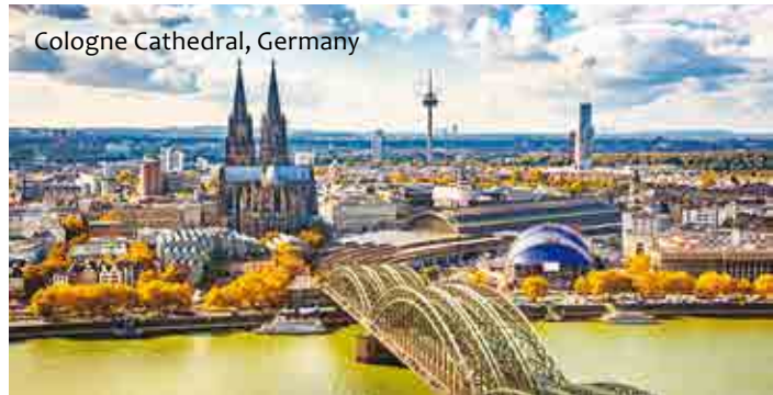
Cologne Cathedral, Germany