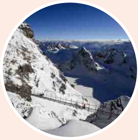
Mount Titlis with Cliff Walk