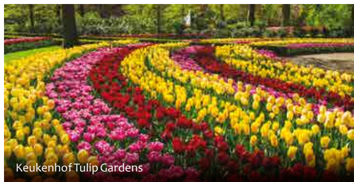
Keukenhof Tulip Gardens