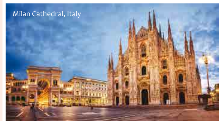
Milan Cathedral, Italy