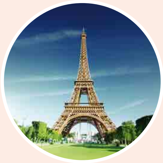
Eiffel Tower, Paris